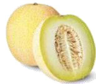
De la Galia