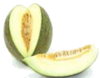
Piel de Sapo